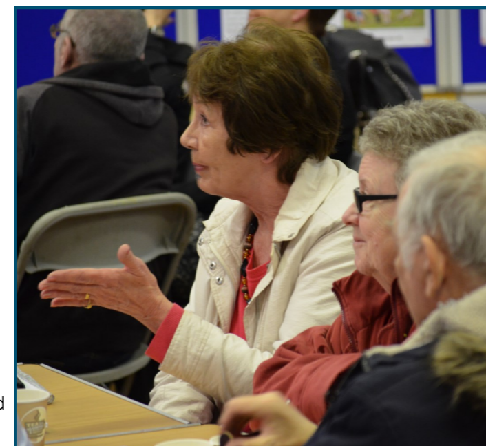
Residents welcomed the opportunity to discuss their concerns with their local senior officers.

The officers in each ward provide a dedicated team patrolling and assisting with community issues in that neighbourhood. In the first instance this team will deal with neighbourhood issues, ASB and community policing, attending meetings (such as our local Forum and PACT meetings) and co-chairing the three Tasking Team meetings where the police, council and other partners look to resolve local crime and grime issues.